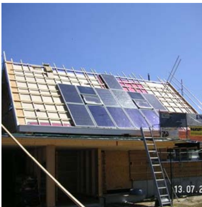
Assembly of the panels

The system is designed for tilted roofs with inclinations between 22° and 65°. The assembly is carried out on a leak-proof roof membrane (rainproof and waterproof). The regulations of the various trades, the relevant national standards and guidelines, and the installation instructions for supplementary materials must be taken into account.