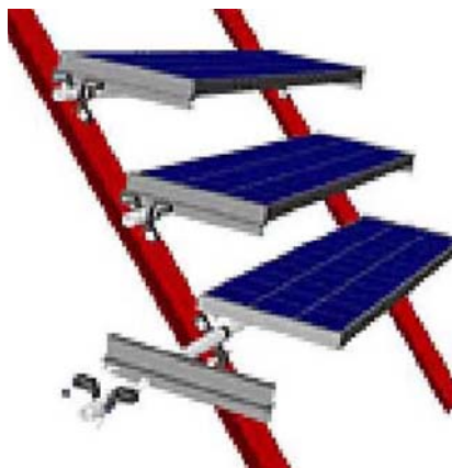
Series of panels