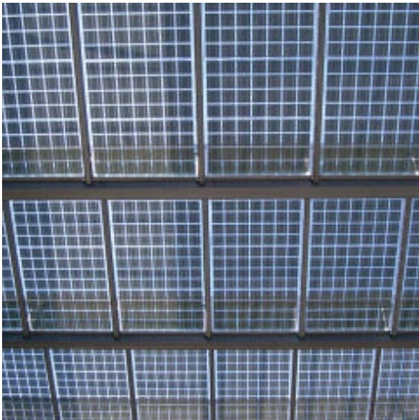
Mögliche Kombinationen Zellentyp – Zellenabstände Possible combinations cell type – cell distances