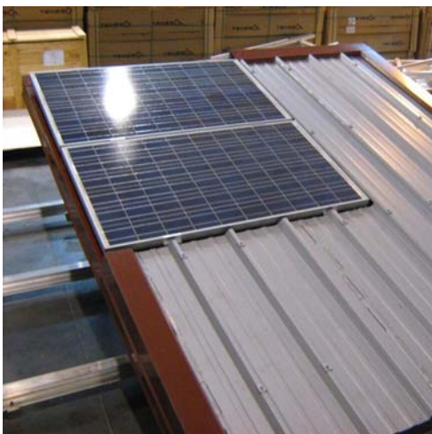
Fastening of modules on the roof battens

Note: before installation, the customer should contact the company to ensure compatibility of modules with the fastening system.